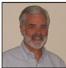
Denver Unit Board to host this tournament.